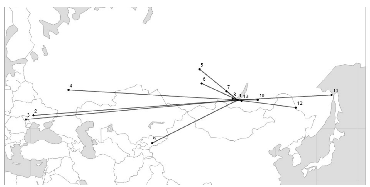
Figure 1. Territorial Representation of the Social Network in a Community of an Orthodox Monastery (Village of Posolskoe, Buryatia)

Observation objects were Orthodox male monasteries on the territory of three economic regions of Russia — Eastern Siberian, Western Siberian, and Far Eastern. The sample of monasteries was made from the list provided in book <u>Monasteries of the Russian Orthodox Church. A Guidebook</u> [2001] where the full list of Orthodox monasteries in post-Soviet Russia was given.